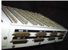
Our Universal Breakout Box or UBOB

Have a specific system you need to breakout? Do other manufacturer's offer a BOB at some enormous price for a unit that only has one primary function?