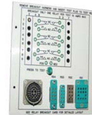
Relay Breakout Module for common relays such Leach, Airpax, Allied Control, ES Portland,

Our Audio / Video modules lists for $1,200 and includes a color monitor,