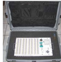
Shipped in Quality Storm Case

Each UBOB-200 comes complete with its own Storm brand carrying case with rollers. Harnesses can be tucked in beneath UBOB to simplify travel.